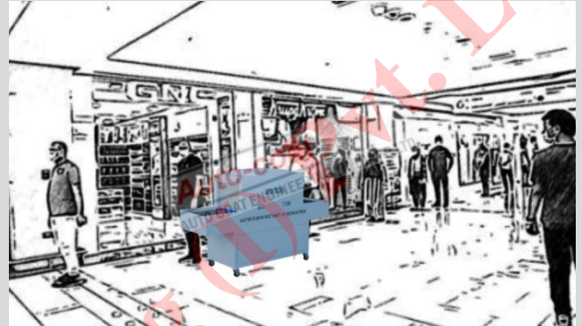
MALLS & SHOPPING CENTERS